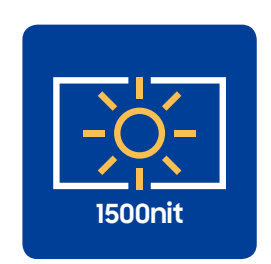
Ultra bright picture quality

Samsung is a global leader in visual display technology and consistently creating industry-leading visual display technologies for a variety of use cases, enabling businesses of all sizes to engage customers and uncover new opportunities. The Terrace for business is Samsung's latest innovation, bringing together key features optimized to create the most impactful visual experience in any outdoor environment. QLED 4K picture quality and 1,500 nit brightness ensure superior picture quality and visibility regardless of sunlight, while IP55 grade protections ensures the display can withstand any outdoor conditions. 16/7 operation hours, an extended warranty and intelligent security features protect the display and the business owner, supported by the Business TV app for a simple content management solution to create a cost-efficient and engaging experience for both businesses and their customers.